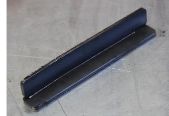
Mild Steel Welding