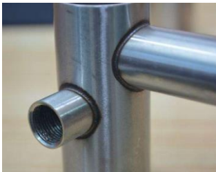
Pipe Construction Welding