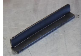
Mild Steel Welding